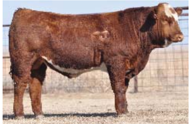
Lot 4 77Y

TJ57J THE GAMBLER DIKEMANS SURE BET MEGAN 9M SSSCRAFTSMAN 004F KD MS CRAFTSMAN 172L KD MS POLLFLECK 246Y Solid Black DNA tested Homo Black. A Sure Bet out of a good cow line. For use on cows only.