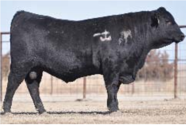
Lot 70 74Y

Aother really good Final Answer. $EN -5.7