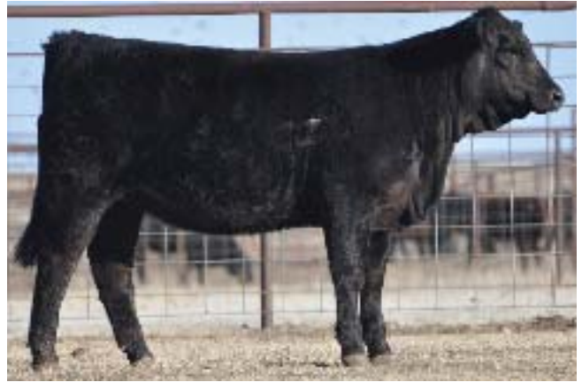
Lot 95 122Y

LORD BYRON DS LORD OF THE RING 243S DS 6 SHOOTER 284M DS KDZINGER 221J 255M DS MS KDZ 255M 322T 54G Black Blaze Face Smooth Polled