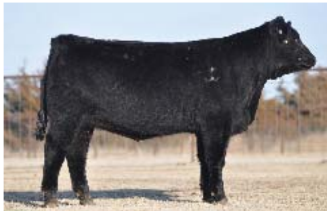
Lot 89 5Y