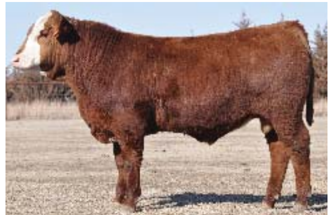
Lot 59 252Y

Solid Black DNA tested Homo Black. He is out of a first calf heifer.