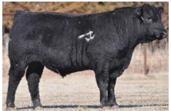
Lot 66 31Y

Another good Jipsey Earl. They will be easy keeping. $EN +23.22