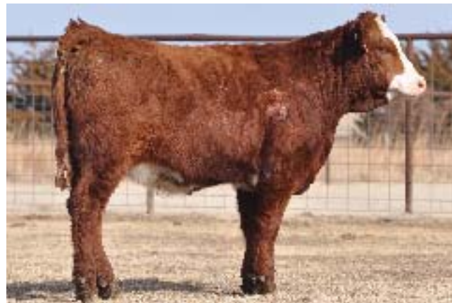
Lot 91 37Y