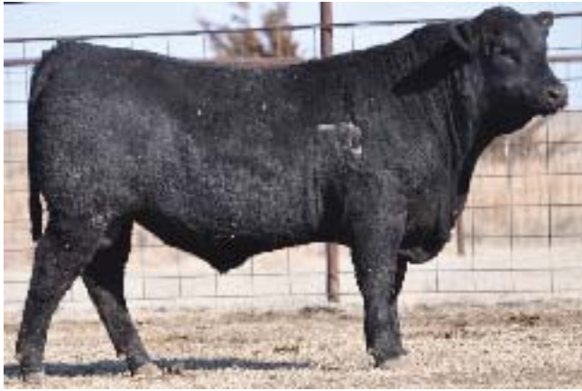
Lot 67 44Y