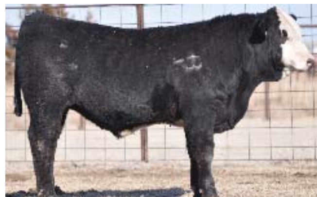
Lot 10 213Y

HOOKS SHEAR FORCE 38K DS Z FORCE 179S 473L DS KDZINGER 221J 255M KD MS KDZINGER 255M 246R KD LORD BYRON 187H Black Blaze Face DNA tested Homo Black.