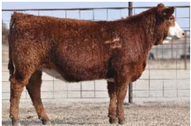
Lot 119 253Y

LORD BYRON DS LORD OF THE RING 243S DS 6 SHOOTER 284M DS ZINGER 64N 193R DS MS ZINGER 193R 308U DA MS AMBUSH 88R Red Blaze Face.