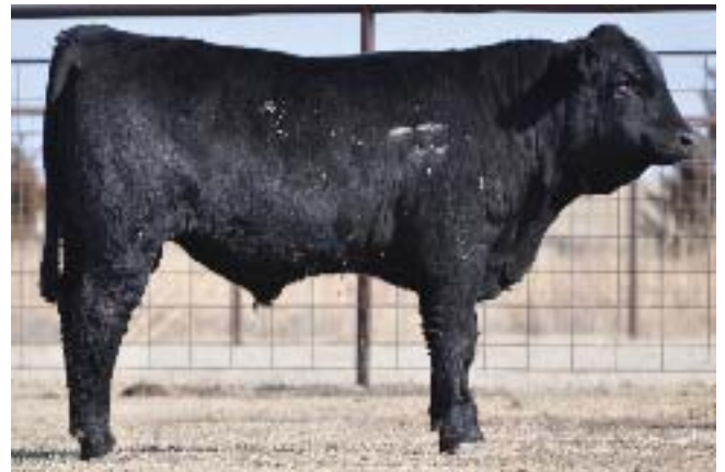
Lot 40 301Y

DS KDZINGER 221J 255M DS KDZ 255M 241R DS MS FULL FIGURES 103L DS 6 SHOOTER 84M DS MS 6 SHOOTER 84M 215S DA ET 6807 100K Solid Black DNA tested Homo Black.