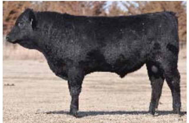
Lot 25 182Y

LORD BYRON DS LORD OF THE RING 243S DS 6 SHOOTER 284M DS LEGACY 128P DS MS LEGACY 128P 361U 400K Black Blaze Face. DNA tested Homo Black.