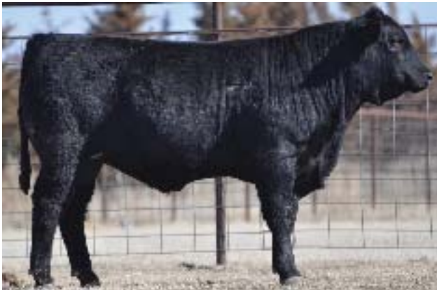
Lot 49 6Y

DS KDZINGER 221J 255M DS KDZ 255M 241R DS MS FULL FIGURES 103L KD MS 508N Black Blaze Face