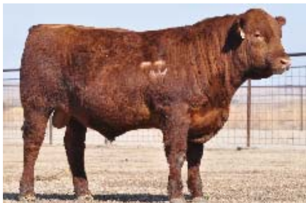
Lot 83 29Y

BECKTON JULIAN B571 CONQUEST 4405P HXC ELLIE MAY MA 638 BIEBER MAKE MIMI DRRA MS MIIMI 40W DRRA MS BECKTON JULIAN 400M A good Conquest out of a first calf heifer