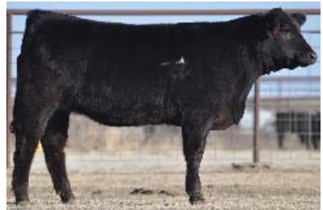
Lot 98 145Y

HOOKS SHEAR FORCE 38K DS Z FORCE 179S 473L DS SIX SHOOTER 3H DS MS SIX SHOOTER 27L DS MS BLACK IRISH 79J Solid Black Smooth Polled