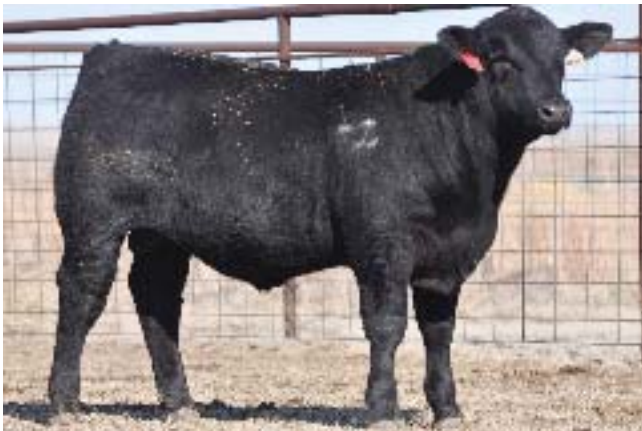
Lot 43 210Y

HOOKS SHEAR FORCE 38K DS Z FORCE 179S 473L DS 6 SHOOTER 151M KD MS SIX SHOOTER 151M KS MS 514N Solid Black.