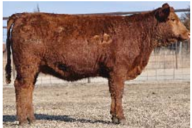
Lot 117 188Y

NICHOLS LEGACY G151 DS LEGACY 128P KD MS RED LIGHT 120H PPSR MONTANA BLAK 793A DA MS MONTANA BLACK 263G FINKS ERICA 621 Solid Black.