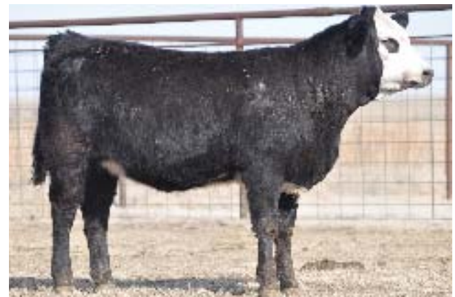
Lot 113 137Y

LORD BYRON DS LORD OF THE RING 243S DS 6 SHOOTER 284M DS ZINGER 64N 193R DS MS ZINGER 193R 196U DA MS 616 40N Black Blaze Face.