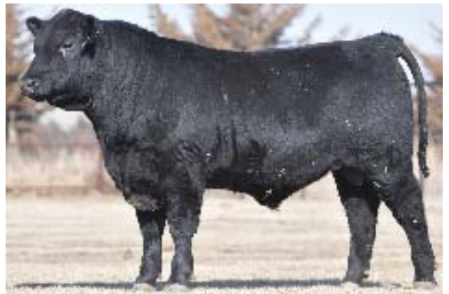
Lot 63 27Y

Jipsey Earl is from the Dulouise Angus in Scotland. We are trying to find cow maker genetics. I think you will like the look of these foundation genetics. $EN +21.39