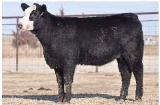
Lot 106 66Y

DS ZINGER 64N 193R DS ZINGER 193R 309U DS MS PS 14N 115R DS LEGACY 128P DS M LEGACY 128P DS MS KDZ 255M 341P Red Blaze Face.