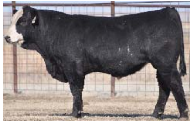
Lot 42 162Y

LORD BYRON DS LORD OF THE RING 243S DS 6 SHOOTER 284M DS P. STOCK 14N DS MS PS 14N 347T DA MS PARAMOUNT AMBUSH Black Blaze Face DNA tested Homo Black