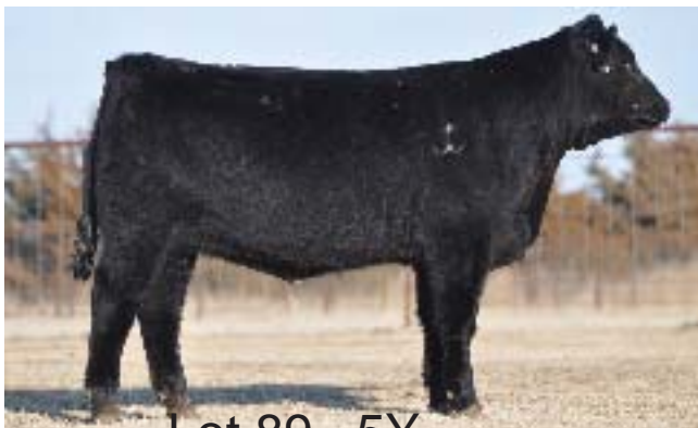
Lot 89 5Y

Can't make the sale? Watch it LIVE and bid in real-time on