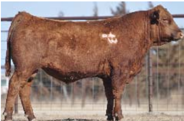
Lot 19 103Y

DS ZINGER 64N 193R DS ZINGER 193R 309U DS MS PS 14N 115R BECKTON LANCER F442 T DS MS LANCER 25P KD MS RED LITE 220K 214M Solid Red Homo Polled