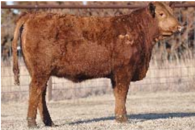
Lot 132 176Y

NLC LCHMN FORTUNE 7347K KD RED FORTUNE 170S 6J DS RC 100 240R Solid Red.