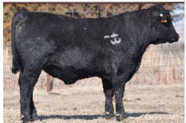
Lot 77 223Y