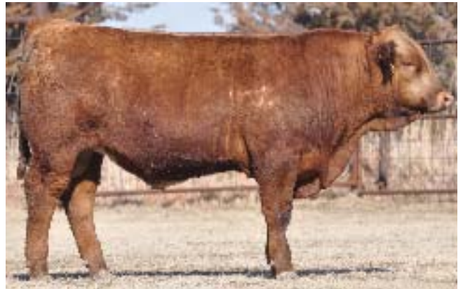
Lot 18 101Y

DS ZINGER 64N 193R DS ZINGER 193R 309U DS MS PS 14N 115R DS KDZINGER 221J 255M DS MS KDZINGER 255M 335S 299N Solid Red. Big stout and thick