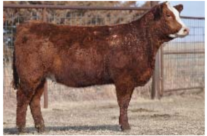
Lot 108 83Y

DS ZINGER 64N 193R DS ZINGER 193R 309U DS MS PS 14N 115R BECKTON LANCER F442T DS MS LANCER 37P DS MS RED BROTHER 76G 28 Red Blaze Face.