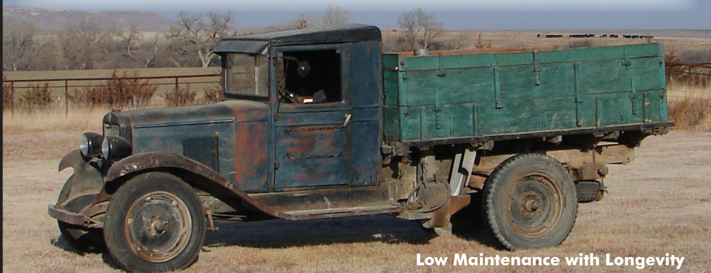
Low Maintenance with Longevity